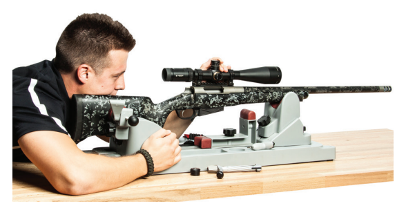
Visually bore-sighting a rifle.