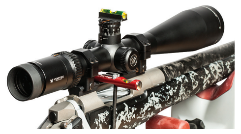
Using bubble levels to square the riflescope to the base.

Note: After aligning the reticle, tighten and torque the ring screws down. Vortex<sup>®</sup> Optics recommends a torque setting of 15-18 in/lbs on the ring screws.